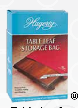
Table Leaf Storage Bag

Made from soft, cotton flannel, the zippered Hagerty Table Leaf Storage Bag stores and protects extra table leaves from chipping and fading. Made in the USA