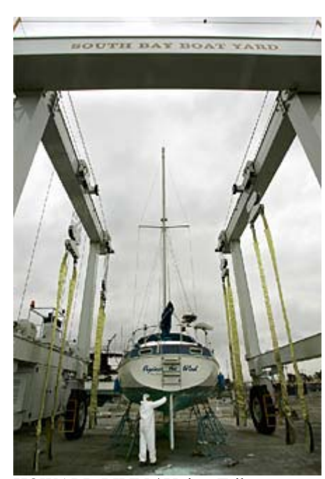
This 100-ton lift will be something of a lightweight when a new crane – billed as the largest of its kind – arrives at the South Bay Boat Yard. The new one can hoist more than 600 tons.

In January 2004, the port and the city wanted to move the boatyard because it was felt an on-site expansion or overhaul would disrupt bayfront development.