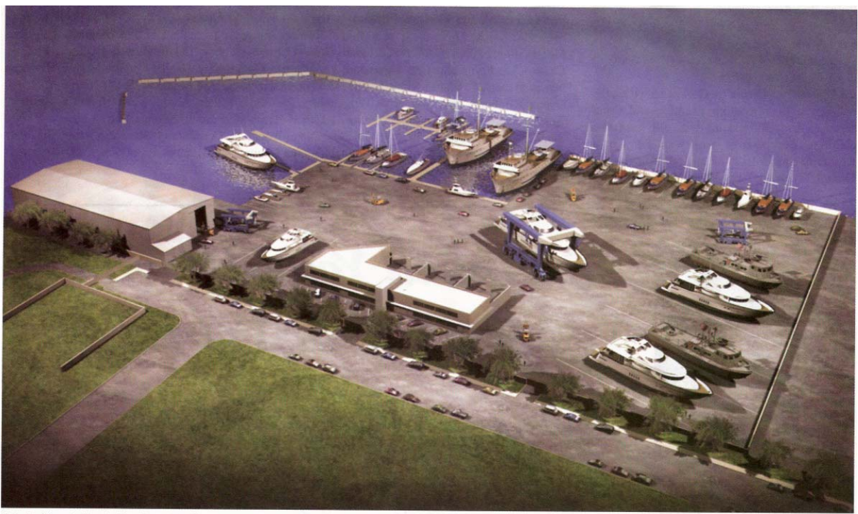
Chula Vista's South Bay Boat Yard unveils a new name — The Marine Group LLC — as work gets under way on its $6 million lift, pier and office project. New lift equipment will increase capacity from 100 tons (vessels 90 feet by 22 feet) to as much as 665 tons (vessels 220 feet by 54 feet) to accommodate the megayachts' megabusiness. The expected wave of new work will pay off $7 on hotel rooms, restaurants, shopping and entertainment for every $1 spent on maintenance and repairs, says company vice president Todd Roberts. This will be a tremendous benefit to the community and we're doing this without government subsidy,' Roberts says. California Bank & Trust provided a $3 million loan. Project contractors include RE Staite Engineering, MW Construction, Whillock Contracting and Triton Engineers. Completion is expected in December.