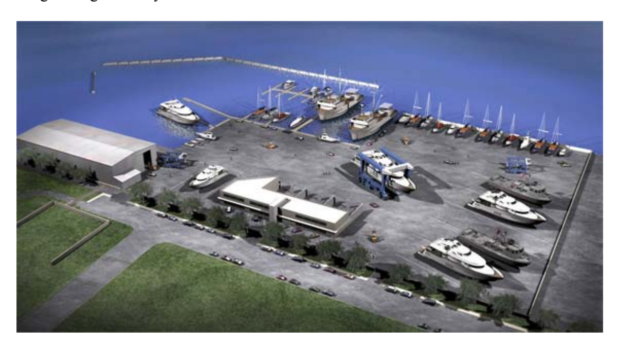
Rendering of the new South Bay Boat Yard.

Since the early 1980s, the South Bay Boat Yard has made its home on one million square feet of land and water along the Chula Vista waterfront, and quietly it became San Diego's largest boat yard.