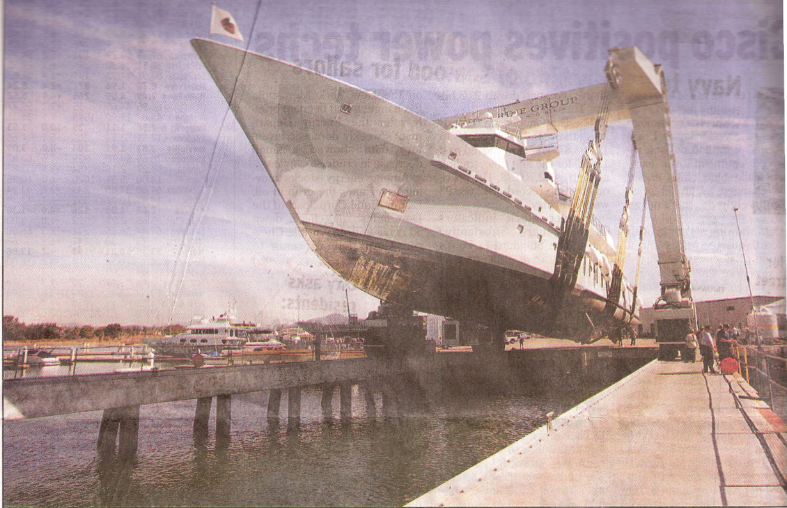
The $50 million mega-yacht Ronin sat in a Travelift at the Marine Group Boat Works in Chula Vista.